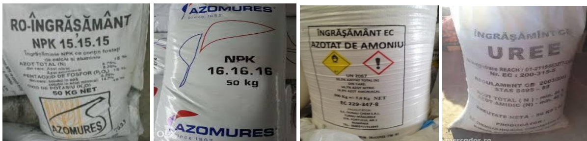
Fig. 1. Types of chemical fertilizers and how they are packaged, stored and presented

Chemical fertilizers are obtained by the physical or chemical processing of products of inorganic nature. In relation to the nutrients they contain as a basic element, they are divided into the following main groups (fig. 1):