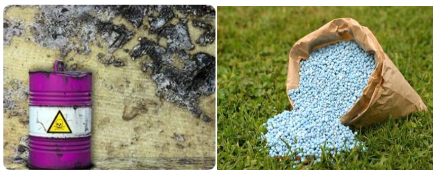
Fig. 2. Soil pollution by inappropriate application of chemical fertilizers

Phosphorus is dispersed in the form of superphosphates, and potassium in the form of potassium nitrate ( \text{KNO}_3 ), silvynil (KCl). Risks of pollution with P and K are low because they are fixed to mineral compounds in the soil. The amount of phosphates circulating between the lithosphere, soils and the hydrosphere has increased considerably. Part of P is immobilized in Ca and Fe soil, and part is entrained by continental waters to water basins or to groundwater, with an inductive role in water eutrophication.