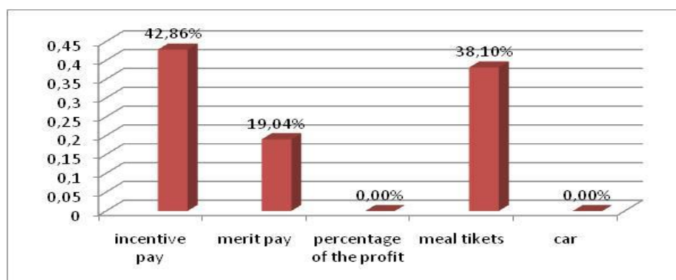
Figure no. 3. Bonus to the salary

Regarding the question about the bonus to the fixed salary, they answered: