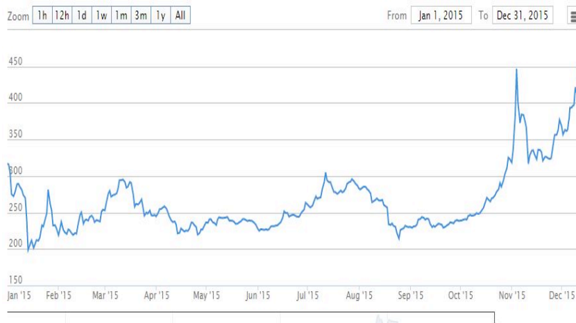
Figure1. Bitcoin price evolution in 2015 [4]

By 2015, any discussion on Bitcoin was contradictory, due to controversies arising its use. But during 2015 Bitcoin position was strengthened, and the voices of skeptics are increasingly less vehement. Analyzing the price evolution (figure 1), we see that on 2015 Bitcoin started with extremely low levels appeared on the virtual collapse of massive currency from 2014 and made a slow increase yet firm.