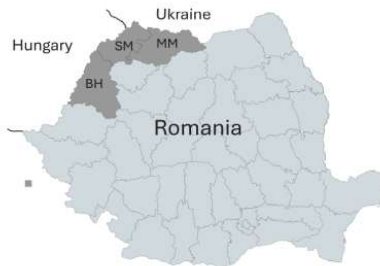
Figure No. 1. Counties from the North-West Region of Romania involved in CBC with Hungary and Ukraine

In the counties of Bihor (BH), Maramureș (MM), and Satu Mare (SM) from the North-West Region of Romania (see Figure 1), collaboration between local communities and their counterparts in neighbouring countries (Hungary and Ukraine) has proven essential for the development of cultural tourism. Cross-border projects, such as those funded through the Interreg Program, have facilitated cooperation between communities and contributed to the development of tourism infrastructure and the promotion of shared cultural heritage (Rădulescu & Pop, 2017).